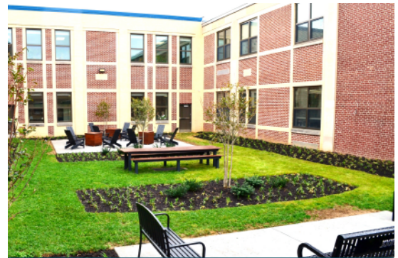
UNIONVILLE HIGH SCHOOL