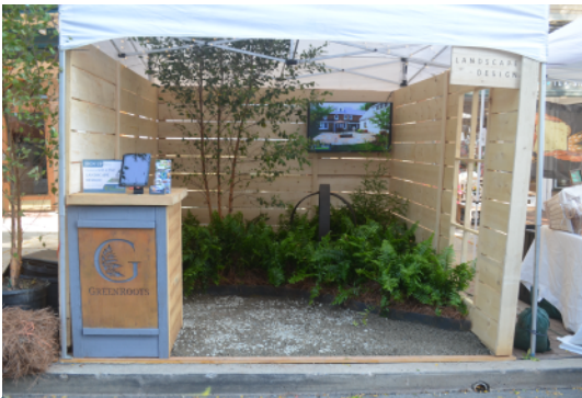
MUSHROOM FESTIVAL SPONSORSHIP

We are committed to being a positive influence and an active member of our community. We have worked with a number of conservancies and parks to install pathways, trails, and walkways that encourage members of our community to get out to enjoy the fresh air. We've worked with Unionville High school to create a beautiful courtyard space and have been involved with various other projects for churches and schools to help make better outdoor spaces for everyone. We sponsor the Mushroom Festival and create a beautiful booth space every year as an opportunity to be a part of our local community. In addition to using our skills to help the community, we also support many different community events, from high school sports teams to various fundraising events.